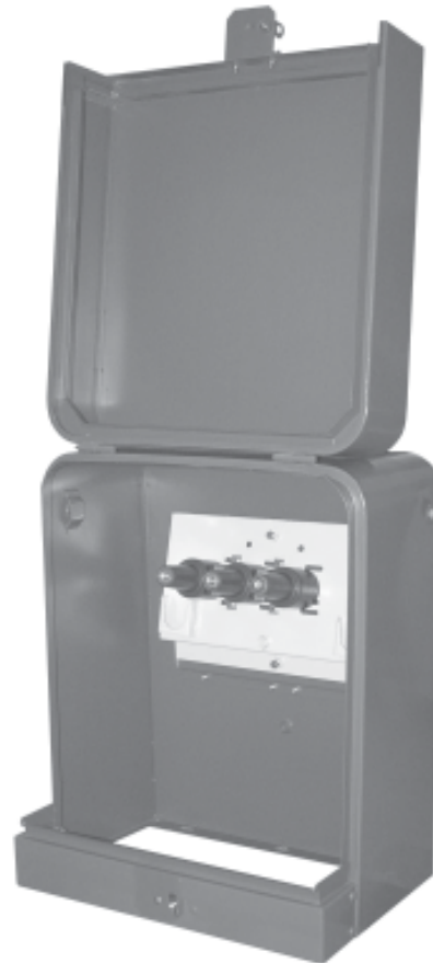
FIGURE 1: Single-phase junction enclosure (shown with optional switching module installed)